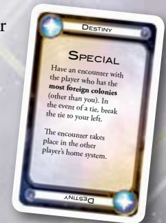
Sample Special Destiny Card

If the drawn card is a special, it will explain the conditions of the encounter. The player indicated by the destiny card is the defense for the encounter, and the card indicates where the encounter must take place. For purposes of game effects (such as the Shadow's execute ability), specials are treated as though the card showed the player color of the player designated as the defense.