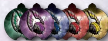
Player Colony Markers

These markers are placed on the track around the warp to record the players' progress towards winning the game.