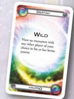
Sample Wild Destiny Card

If the drawn card is a wild, the offense may have an encounter with any player of his or her choice. For this encounter, the chosen player is the defense. The encounter must take place in the chosen player's home system.