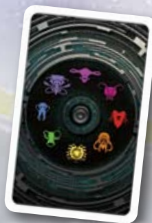
Destiny Card Back

The offense then draws the top card of the destiny deck. The destiny deck contains colors, wilds, and specials. If there is only one card left in the deck, do not draw it. Instead shuffle the final card and the destiny discard pile together to form a new destiny deck and draw from the new deck.